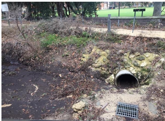
Figure 1 - Nutrient stripping basin at Stirling Road Park

Stormwater runoff can negatively impact wetlands through the transport of contaminants such as heavy metals, hydrocarbons and propagules of weedy plants. Historically, six drains carried stormwater from surrounding areas directly into the lake, including from an agricultural style drain along the eastern side of the Scotch College playing fields. Improvements at Lake Claremont have seen the creation of nutrient stripping basins and ponds that allow the inflow of stormwater into areas where reeds and aquatic plants act to remove nutrients and other materials from the water before it enters the main wetland area (Figure 1). These nutrient stripping basins also act to treat stormwater flowing into the Lake Claremont catchment from Claremont and Nedlands.