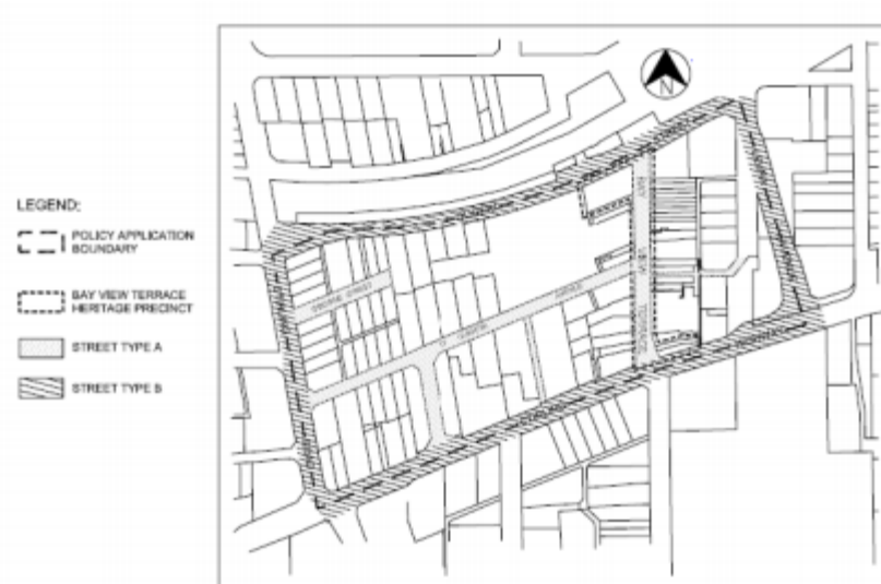
Map 2 – Location of Street Types A and B