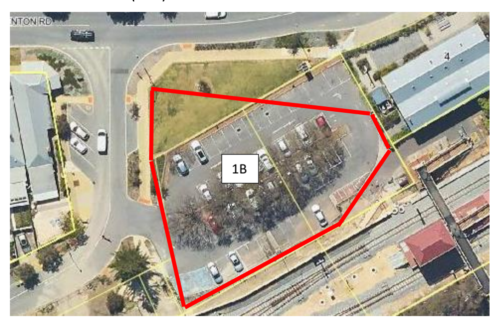
1B – Car Park 5 - corner Claremont Crescent and Shenton Road