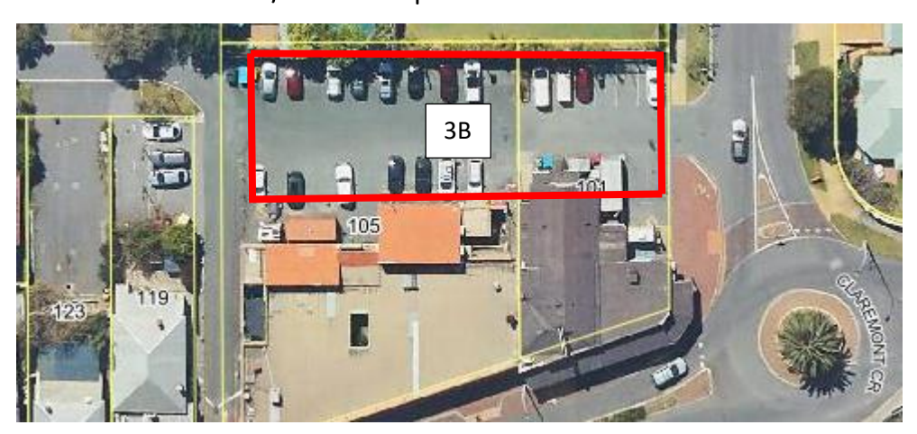
3B – Swanbourne Rear of 101-105 Claremont Crescent – subject to landowner agreement