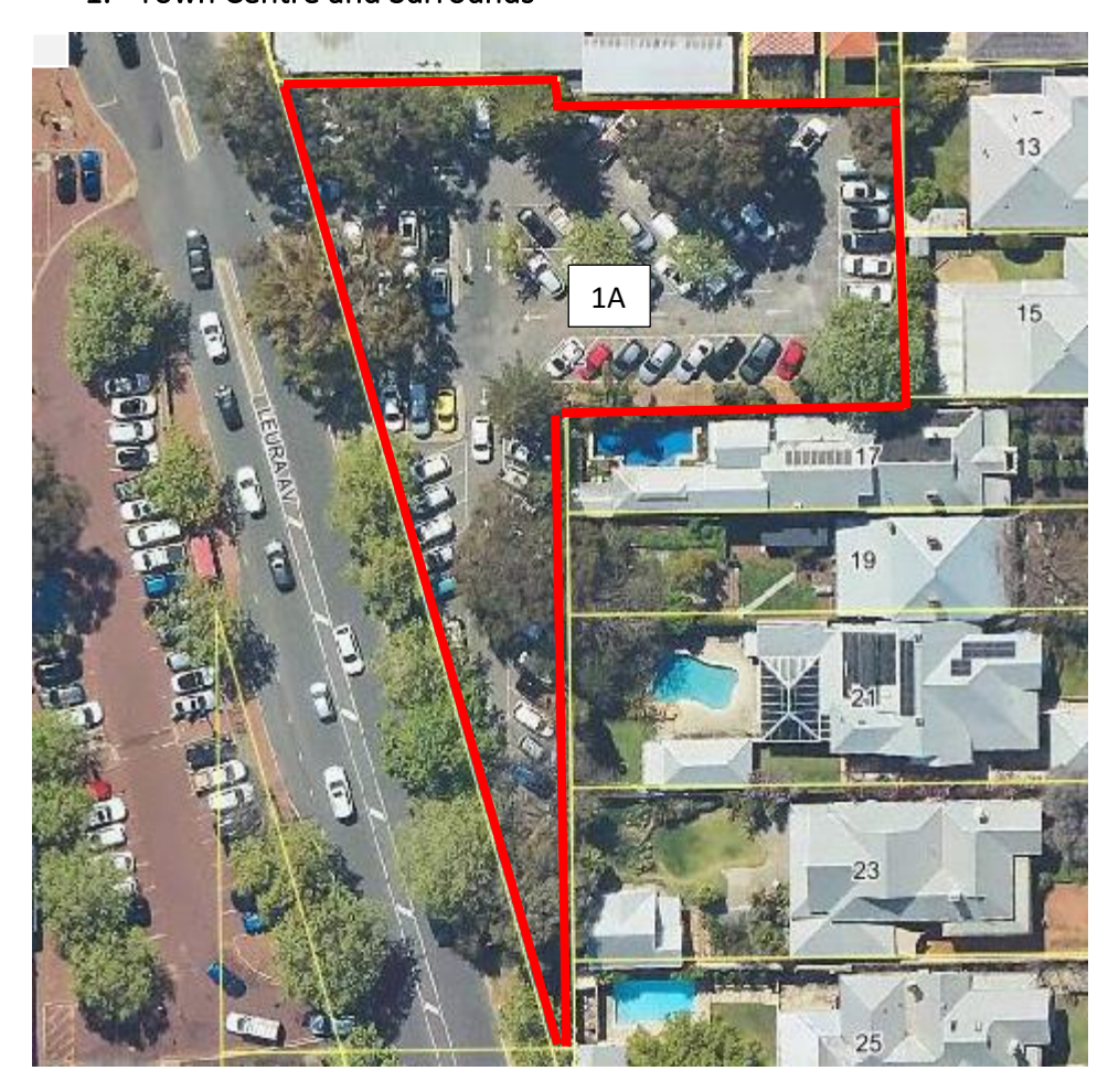
1A - Leura Avenue (east)