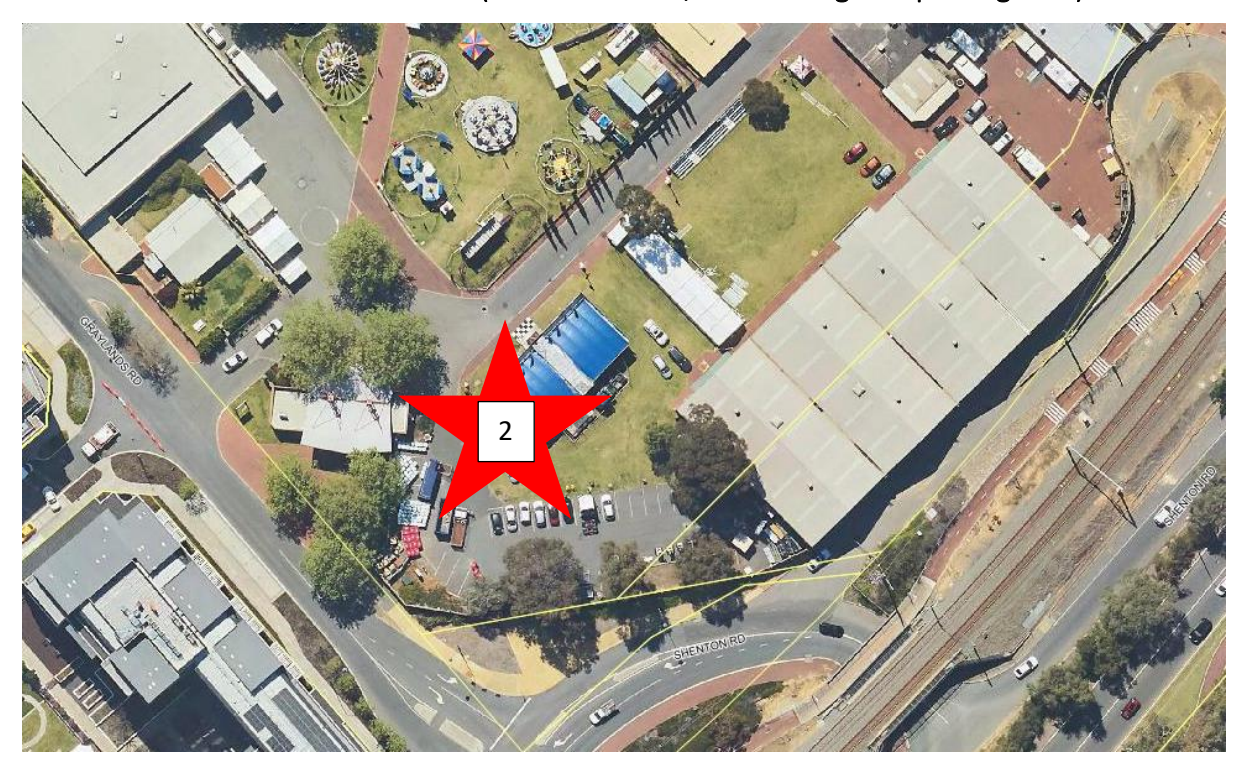
– Corner Graylands Road and Shenton Road – Royal Agricultural Society Showgrounds – subject to landowner agreement