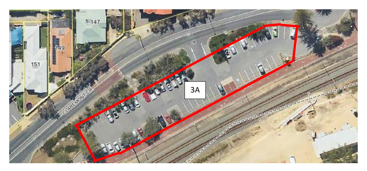
3A – Swanbourne PTA/Council Carpark