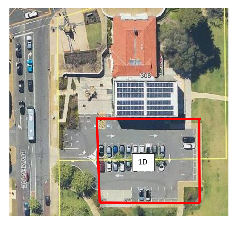
1D - Council's administration office (additional deck/s above at grade parking area).