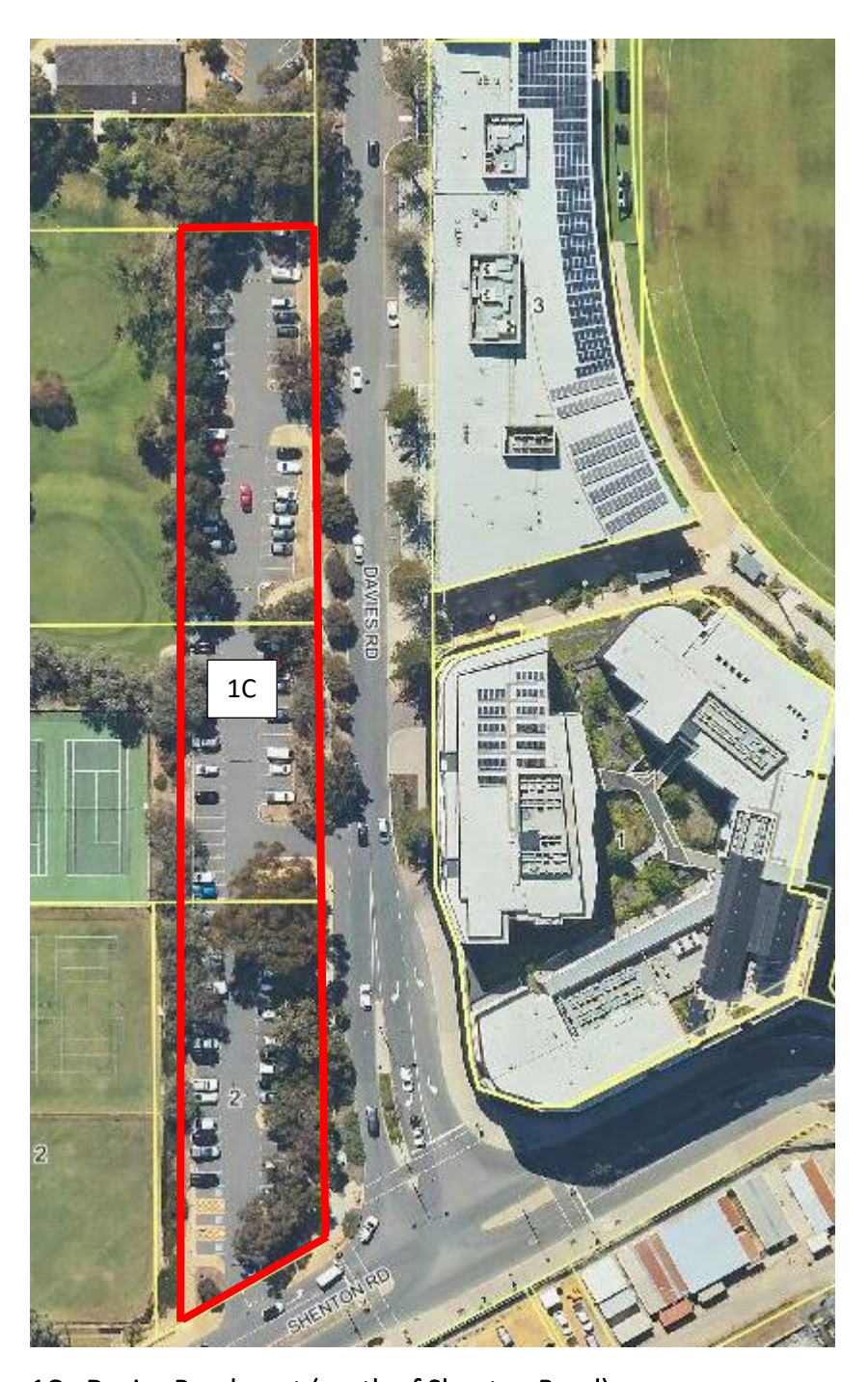
1C - Davies Road west (north of Shenton Road)