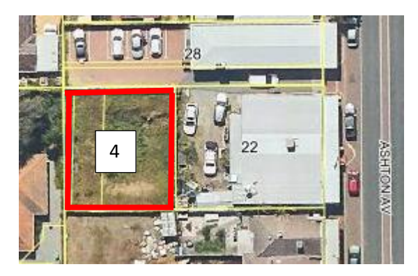
4 – Council Drainage Sump – rear of 28 Ashton Avenue